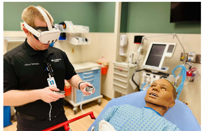
HealthPartners Institute Clinical Simulation Center at Regions