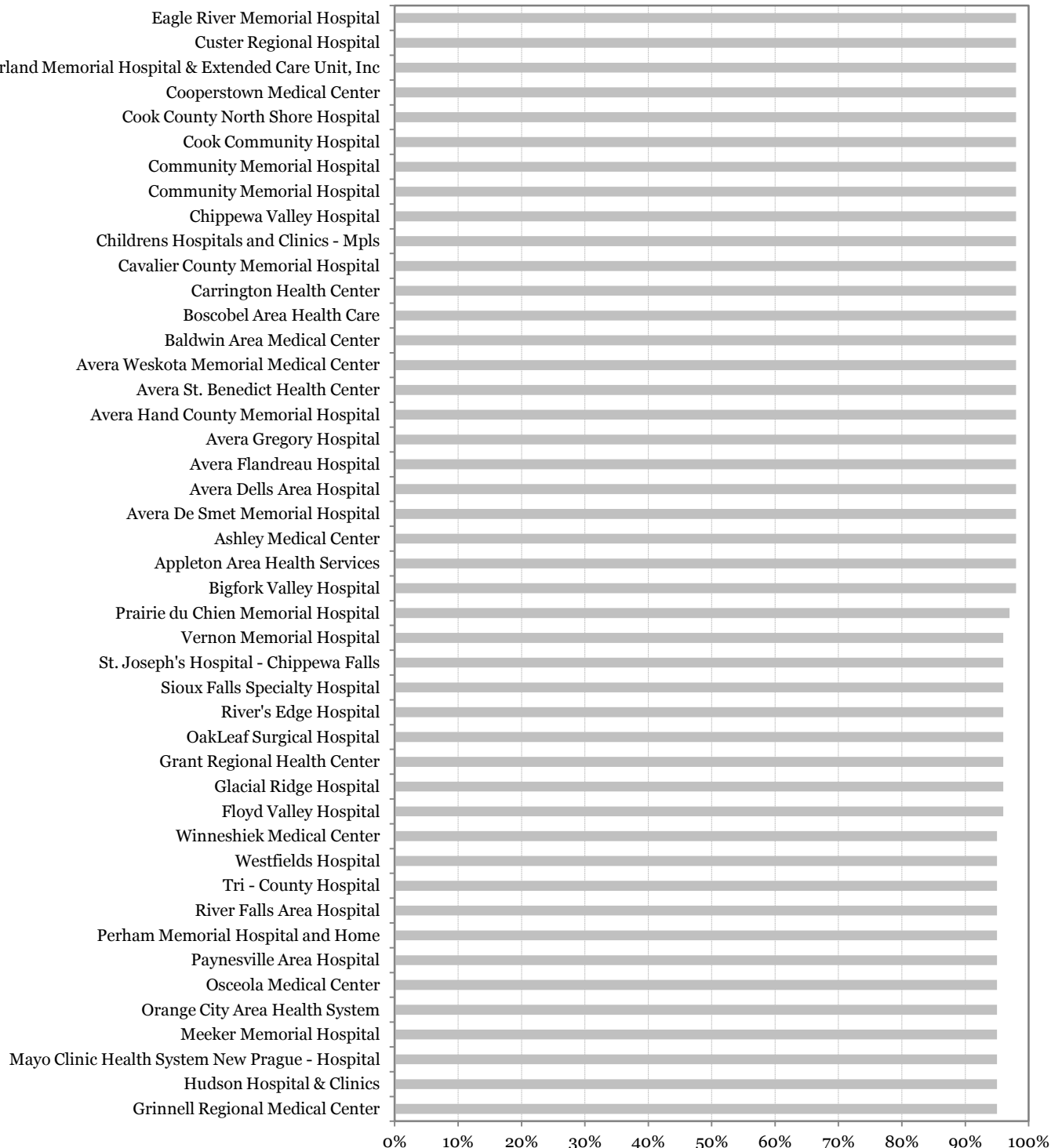
Page 3 of a 6 Page Graph

This percentage represents the linear average of patient responses to the question of how often nurses communicated well.