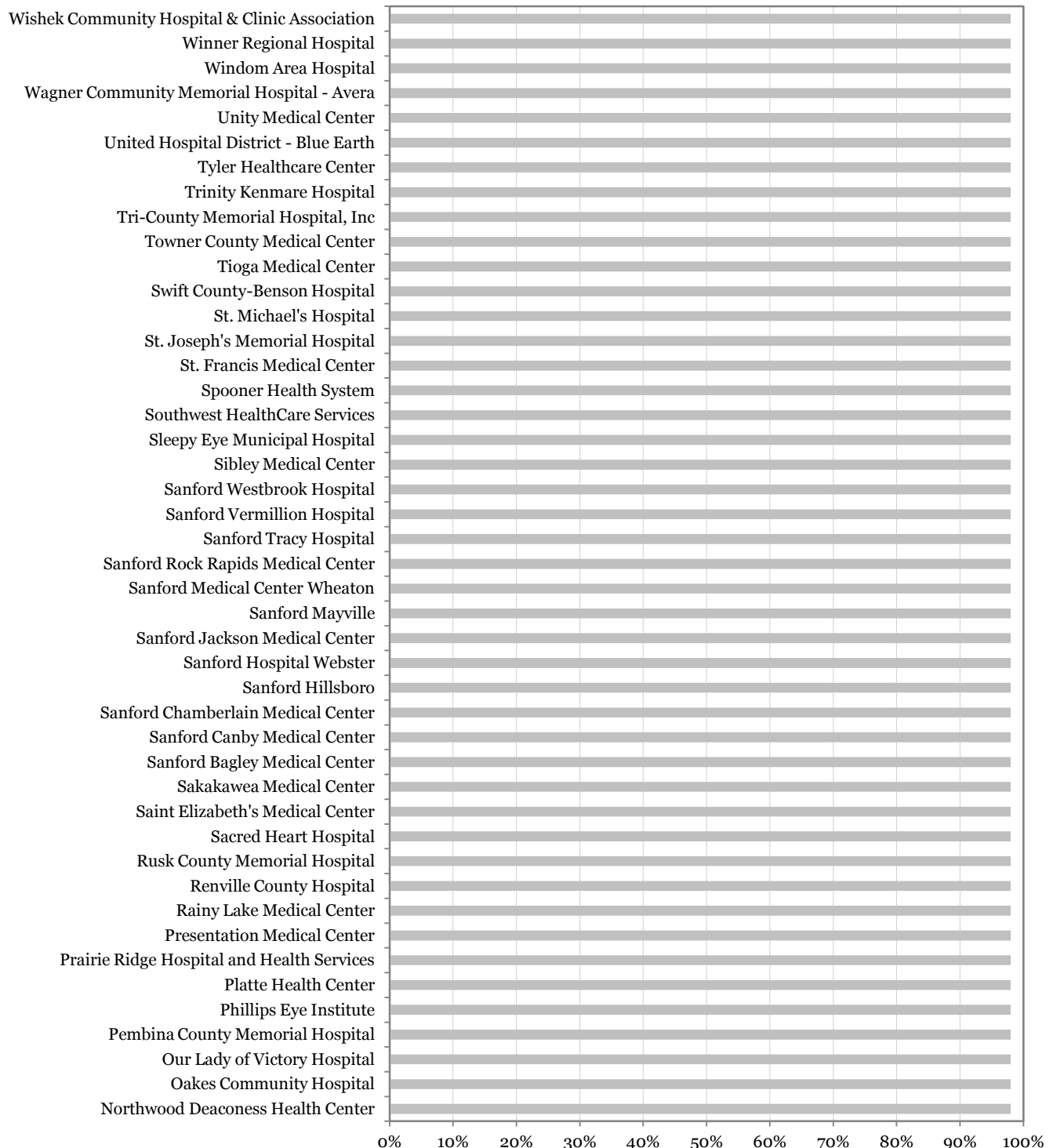
Page 1 of a 6 Page Graph

This percentage represents the linear average of patient responses to the question of how often nurses communicated well.