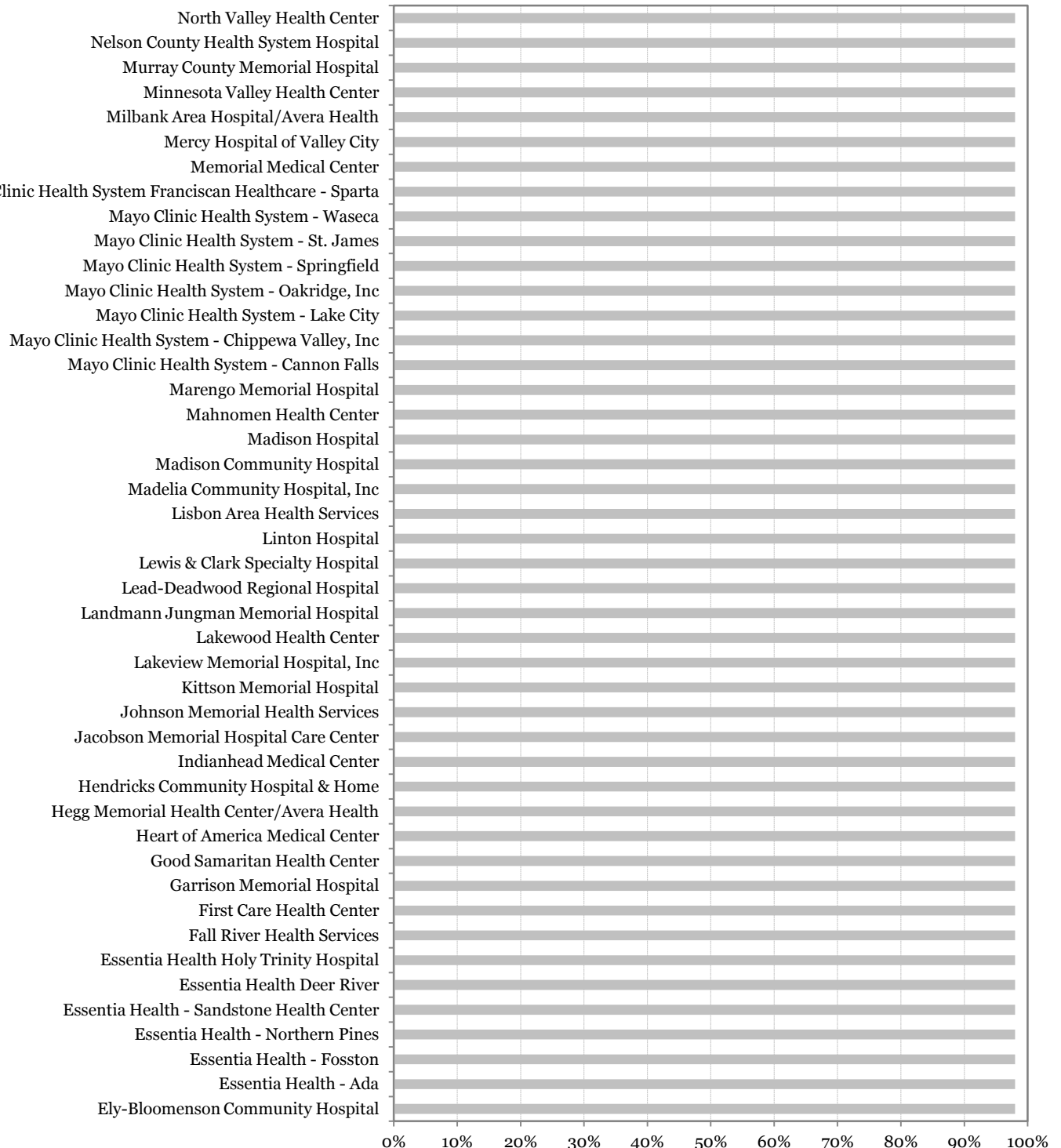
Page 2 of a 6 Page Graph

This percentage represents the linear average of patient responses to the question of how often nurses communicated well.