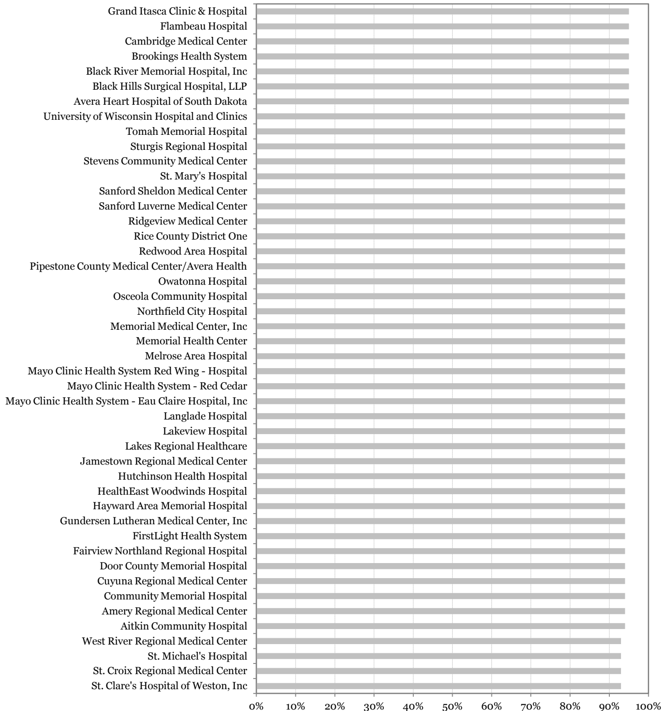
Page 4 of a 6 Page Graph

This percentage represents the linear average of patient responses to the question of how often nurses communicated well.