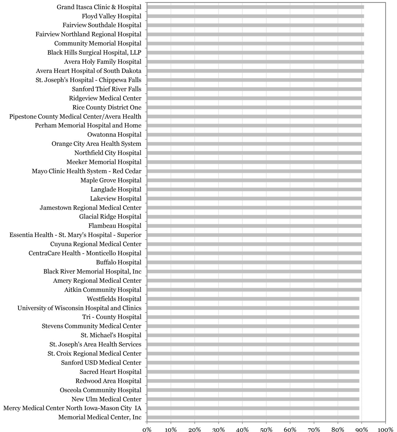
Page 4 of a 6 Page Graph

This percentage represents the linear average of patient responses to the question of how often patients pain was well controlled.