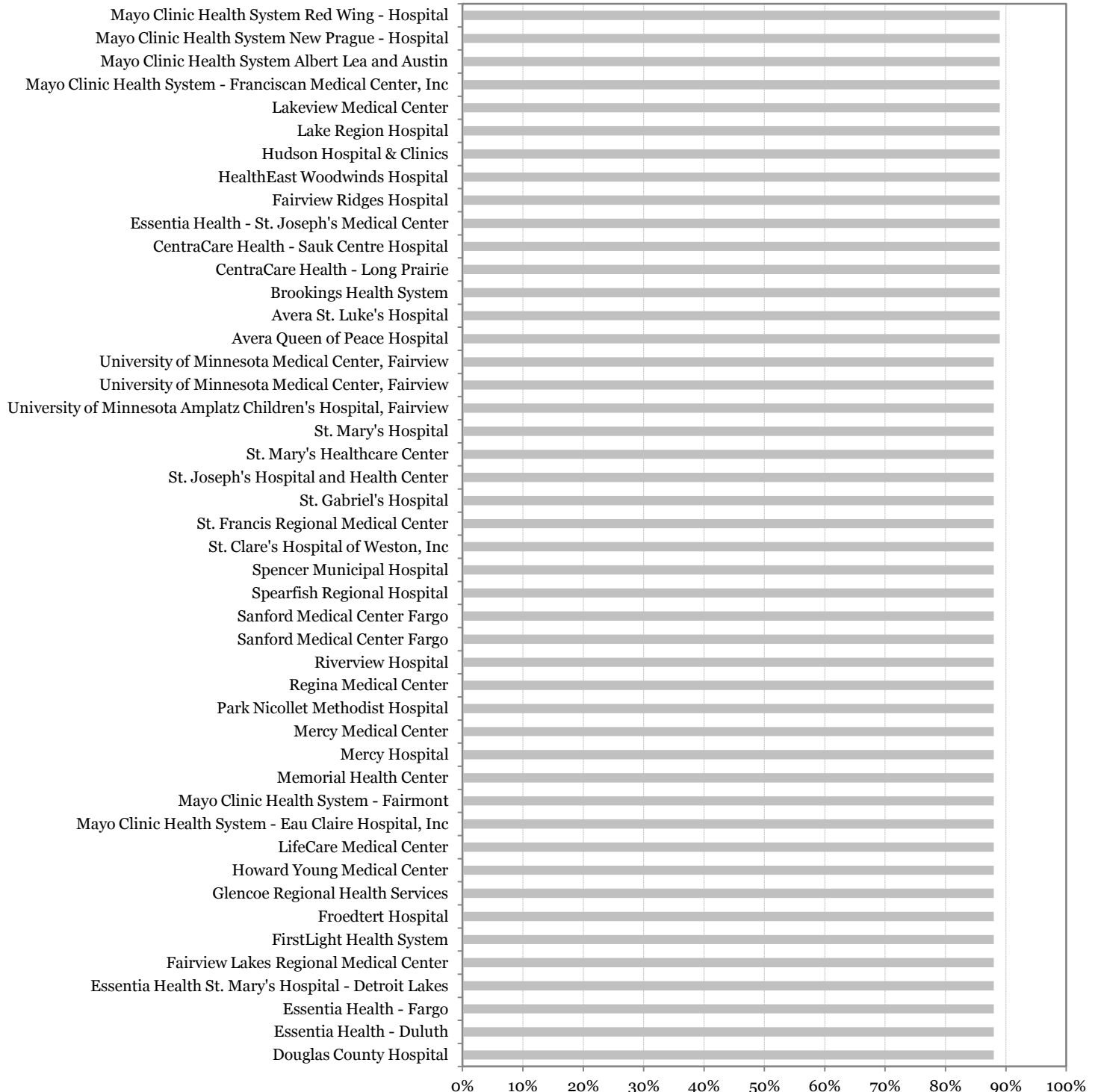
Page 5 of a 6 Page Graph

This percentage represents the linear average of patient responses to the question of how often patients pain was well controlled.