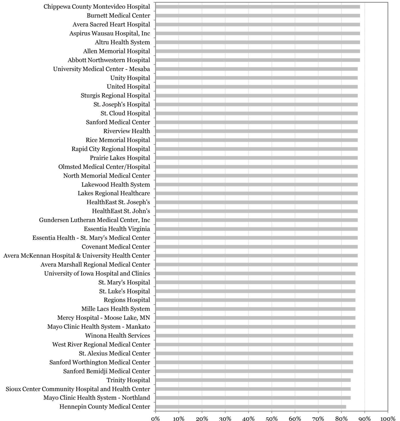
Page 6 of a 6 Page Graph

This percentage represents the linear average of patient responses to the question of how often patients pain was well controlled.