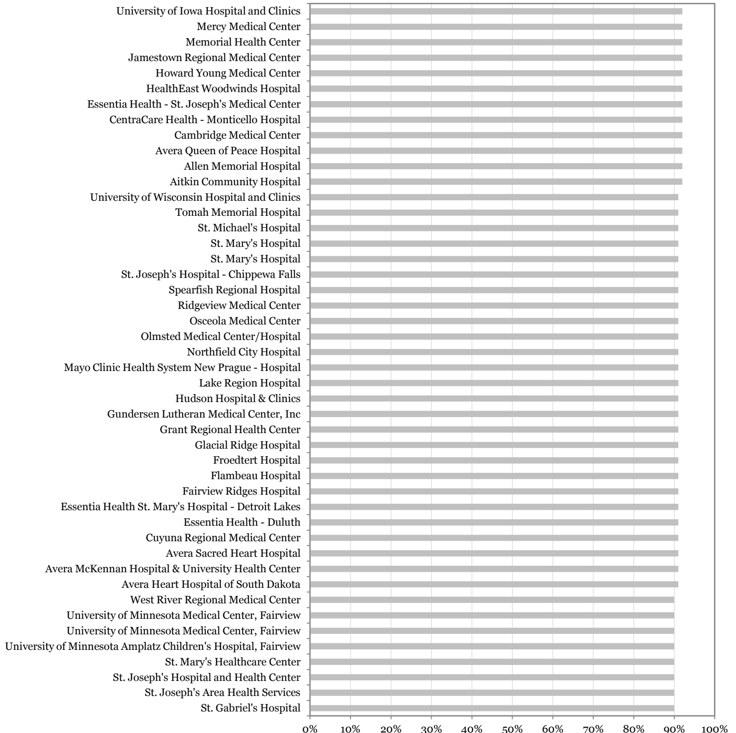
Page 4 of a 6 Page Graph

This percentage represents the how often patients were given information about what to do during their recovery at home.