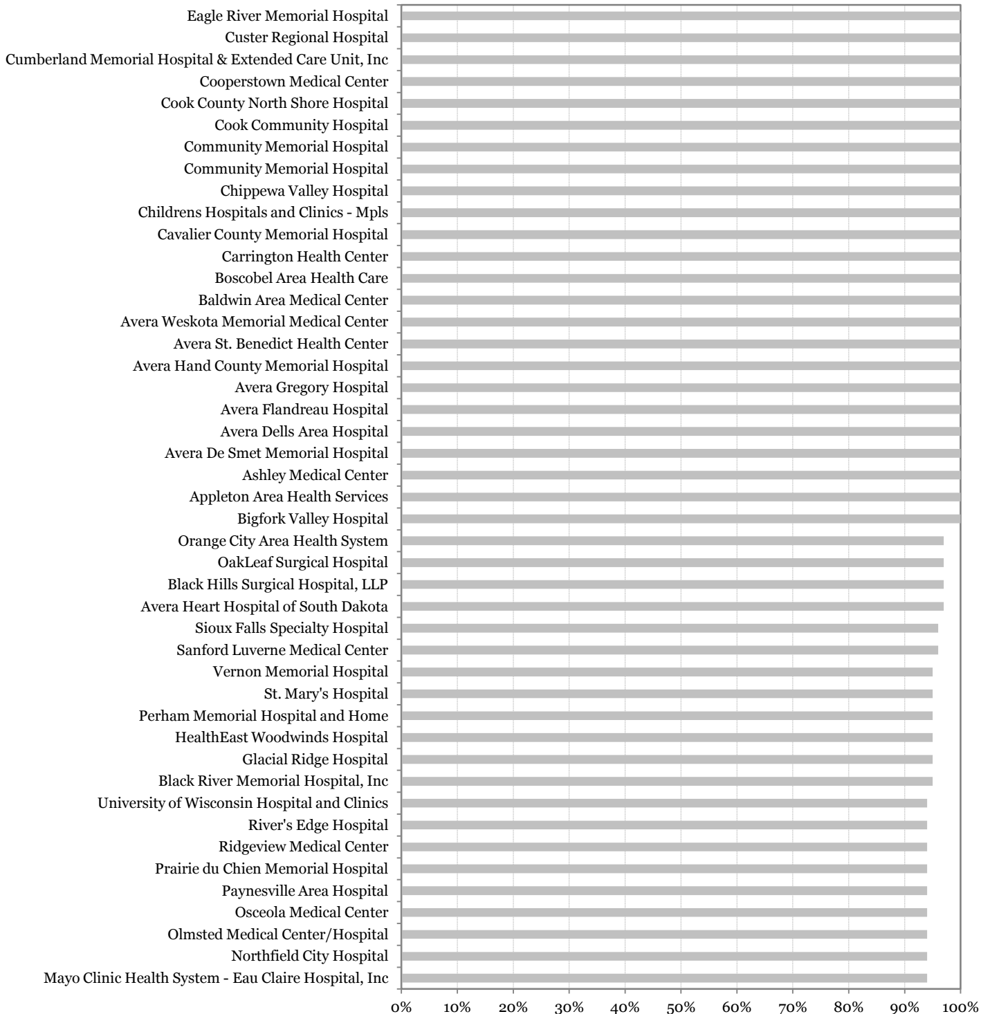
Page 3 of a 6 Page Graph

This percentage represents the linear average of patient responses to the question of would they recommend the hospital.