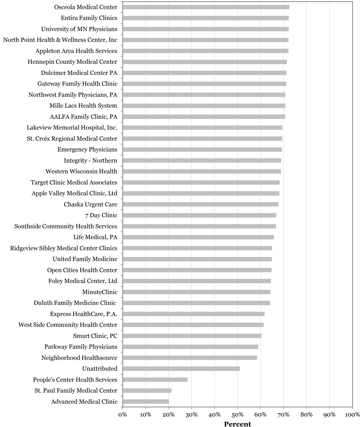
Page 3 of a 3 Page Graph

The bar charts and percentages below will tell you how successful Minnesota physicians and other health care providers are in helping women get a mammogram.