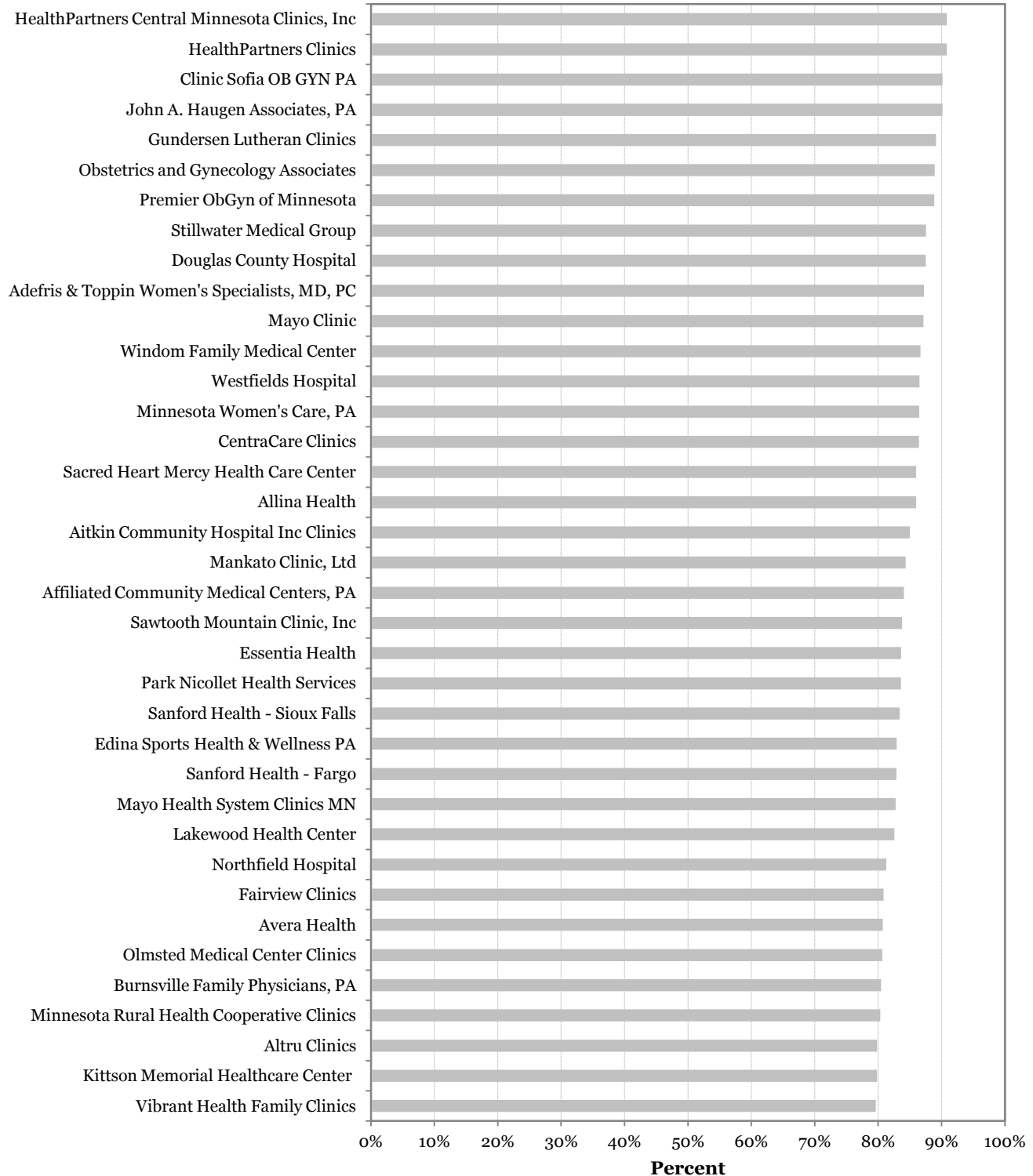
Page 1 of a 3 Page Graph

The bar charts and percentages below will tell you how successful Minnesota physicians and other health care providers are in helping women get a mammogram.