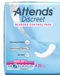
Attends® Discreet Women's Moderate Bladder Control Pad* Count: 20 ct.