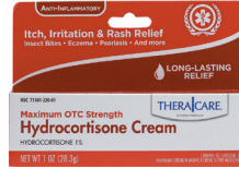
Hydrocortisone Cream, 1%, 1 oz. Count: 1 ct.