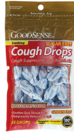
Cough Drops, Sugar-Free Count: 25 ct.