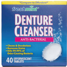
Denture Cleaning Tablets Count: 40 ct.