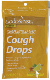
Cough Drops, Honey Lemon Count: 30 ct.