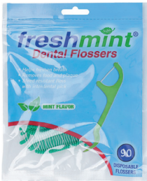
Interdental Flossers Count: 90 ct.