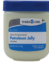
Petroleum Jelly, 4 oz. Count: 1 ct.