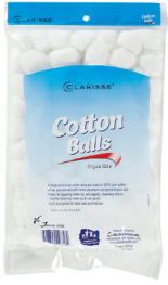
Cotton Balls Count: 100 ct.