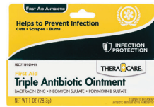
Triple Antibiotic Ointment, 1 oz. Count: 1 ct.